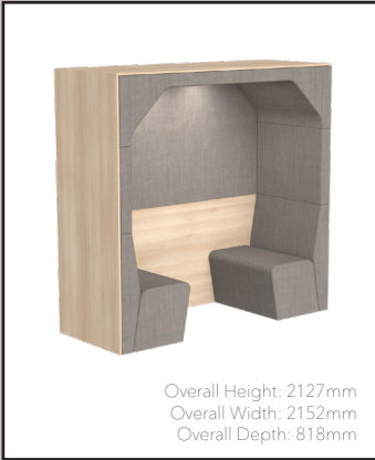
BY-2P-C 2 Person Booth CLOSED Back