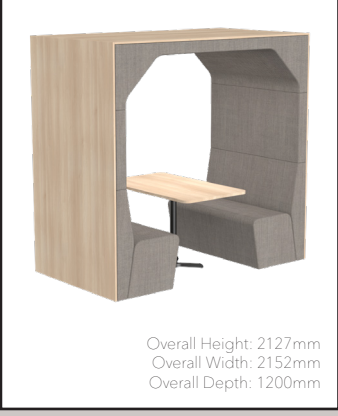
BY-4P-OWS 4 Person Booth OPEN Back with Worksurface