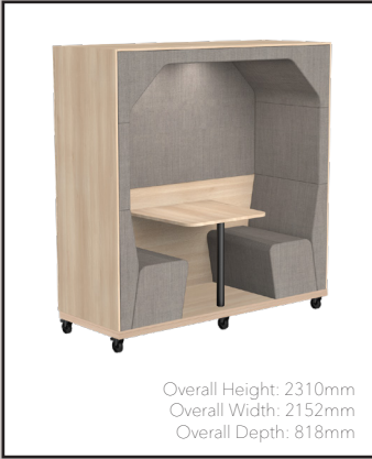
BY-2P-CWS-MOB 2 Person Booth CLOSED Back with Worksurface