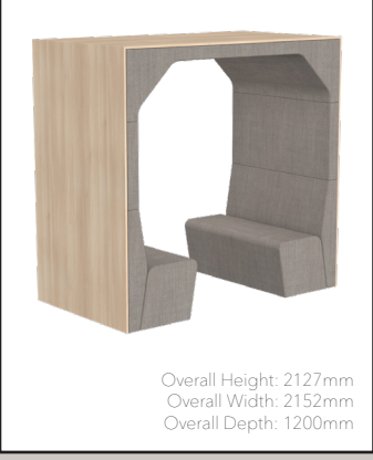
BY-4P-O 4 Person Booth OPEN Back