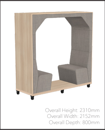
BY-2P-O-MOB 2 Person Booth OPEN Back