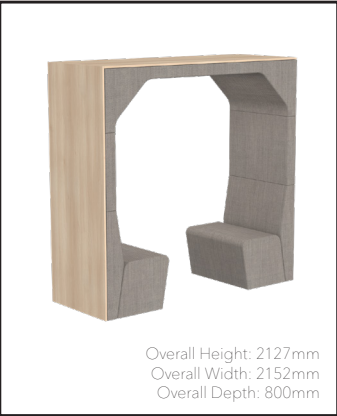
BY-2P-O 2 Person Booth OPEN Back