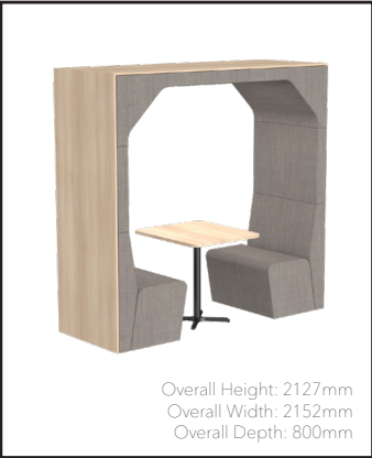
BY-2P-OWS 2 Person Booth OPEN Back with Worksurface