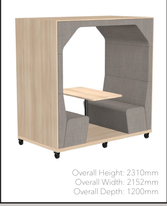
BY-4P-OWS-MOB 4 Person Booth OPEN Back with Worksurface