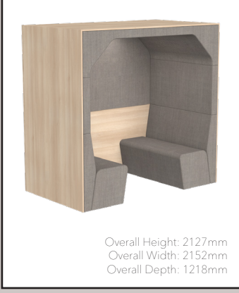
BY-4P-C 4 Person Booth CLOSED Back