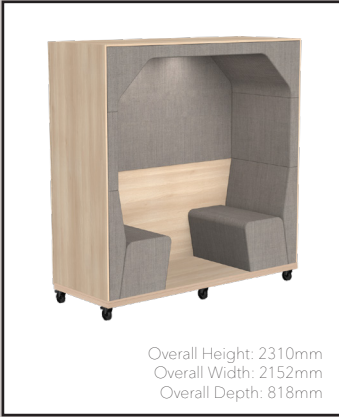
BY-2P-C-MOB 2 Person Booth CLOSED Back