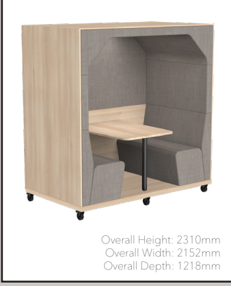
BY-4P-CWS-MOB 4 Person Booth CLOSED Back with Worksurface