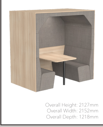
BY-4P-CWS 4 Person Booth CLOSED Back with Worksurface