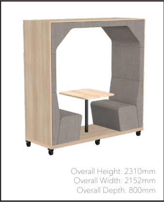
BY-2P-OWS-MOB 2 Person Booth OPEN Back with Worksurface