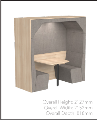
BY-2P-CWS 2 Person Booth CLOSED Back with Worksurface