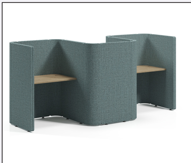
3 Person Reverse Facing