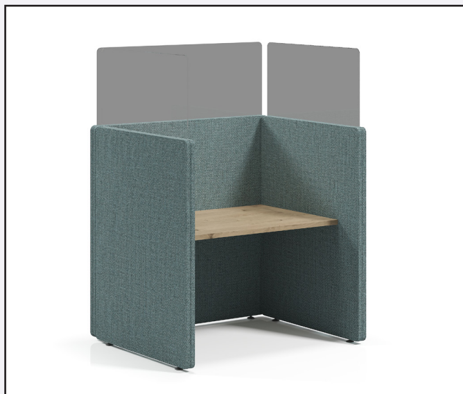
1 Person Glazed