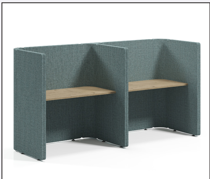
2 Person Side-By-Side