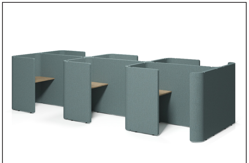
6 Person Cluster