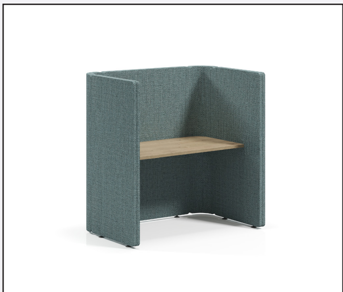
1 Person Booth