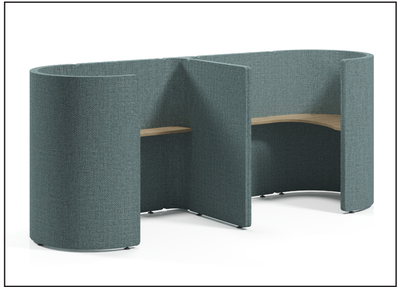
2 Person Curved