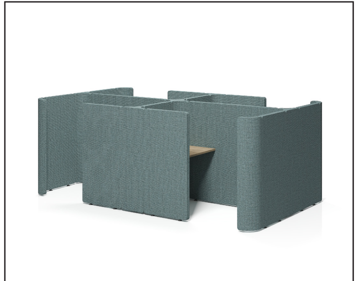
4 Person Cluster