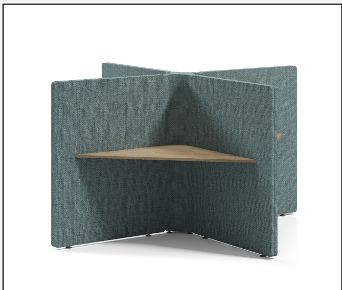
4 Person Cruciform