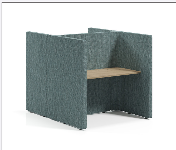
2 Person Back-2-Back