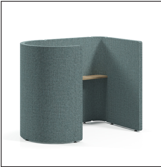
1 Person Curved